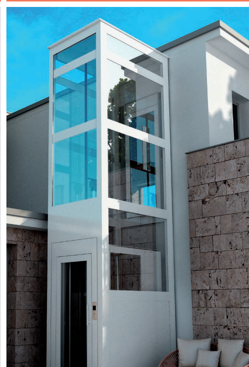
Lift shaft structure