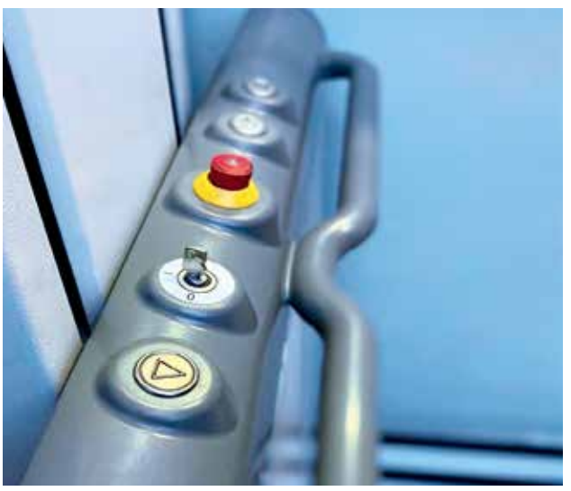
Detail of the control buttons