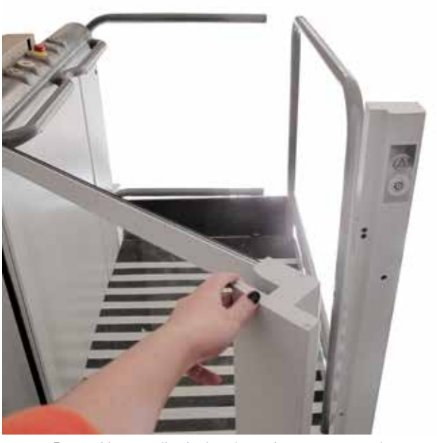
Door with versatile design that adapts to any environment