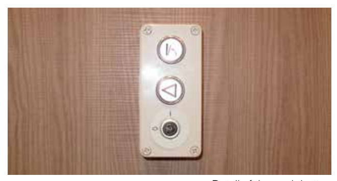
Detail of the push button