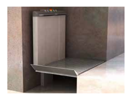
*For distances of less than 500 mm the solution is easier and therefore cheaper: No protective arms, handrails, or upper level entrance door required.